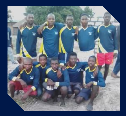
Kalabo Village FC wearing LUFC kit – Zambia 2020