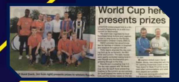
McDonalds 6 A-Side Charity Tournament ~ 2005