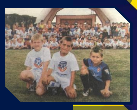
Sir Bobby Charlton Soccer School - International