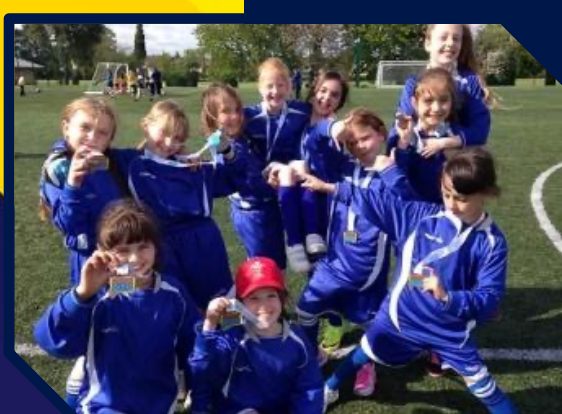
Top - Bottom - Various Photos from Hosted School Events