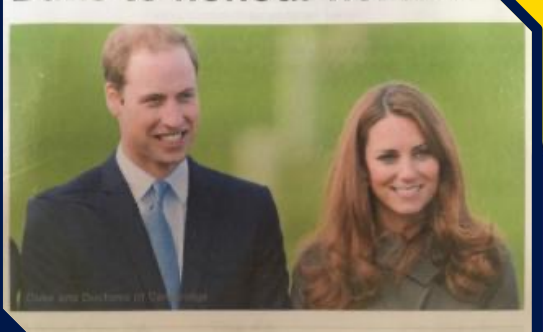
HRH The Duke of Cambridge is to welcome 150 grassroots heroes to Buckingham Palace

One of our teams receiving the FA's Annual Fair Play Award in 2019